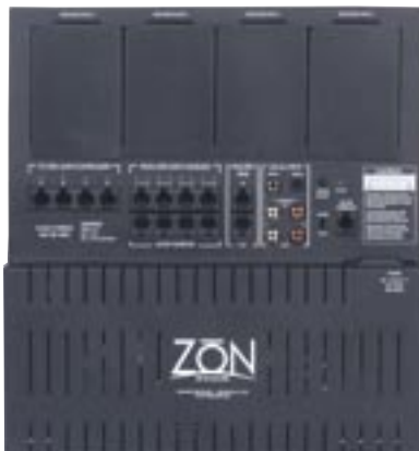
Stylish ZON controllers are supplied through this router.

The box uses Multilet ’s technology, under an agreement with Multilet US. Because TV and Ethernet use signals at different frequencies, they can be