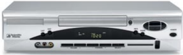
New set-top box from Scientific Atlanta writes to most DVD formats and handles HD content.

Google Co-Founder and President of Products Larry Page demonstrated prototype applications of the popular Google Earth software, including an in-dash version through a partnership with Volkswagen and a real-time