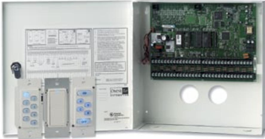
Omni IIe from HAI controls a sophisticated home network through the electrical wiring.

Two industry groups, the Universal Powerline Association (UPA) and the European Union consortium OPERA (Open PLC European Research Alliance) , have adopted DS2 technology in support of multi-vendor standard certified product. For more information, see www.ds2.es .