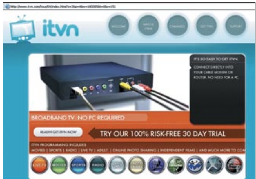
ITVN's small "set-top box" is closer to the size of the Ethernet routers used by others who ride on bandwidth, such as VoIP lines. Outputs are for composite, S-video and RGB video.

Then there's ITVN , Interactive Television Networks. Buy the set-top