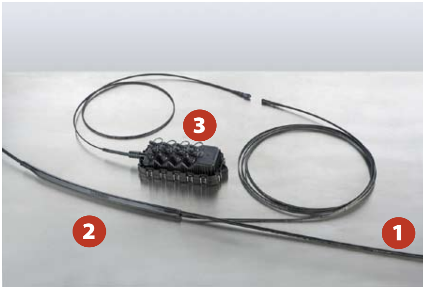
Figure 2: The Terminal Distribution System and its key components. 1 is the system distribution cable; 2 is the tethered system access point and 3 is the system terminal.

those solutions were displaced by the novel components that now fit together like the interlocking pieces of a jigsaw puzzle.