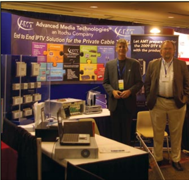
AMT's product offerings also include many of the industry's leading manufacturers such as DX Antenna, BlonderTongue, Motorola, Pacific Broadband Networks, DX Antenna, Adtec, Drake, Olson and Emcore.