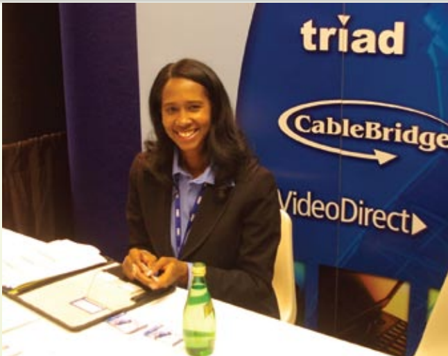
For 15 years ETI has provided world-class billing and operational support software products deployed by over 100 telecom carriers, municipalities and private broadband network operators.