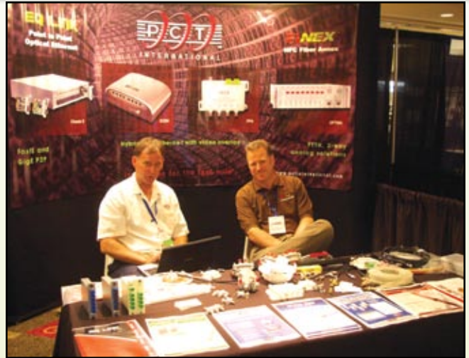
PCT focuses on innovative and cost-effective solutions allowing service providers to improve system integrity and expansion of their service offerings. PCT's portfolio includes transmission and connectivity products for the broadband, CATV, satellite and structured wiring markets.