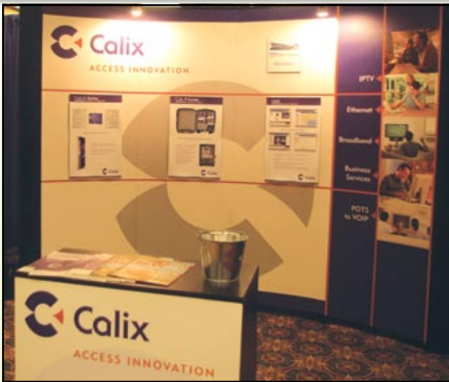
Calix has supplied equipment to more non-RBOC fiber networks than any other company.