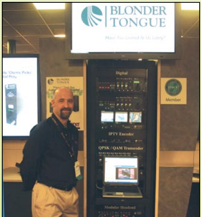
Blonder Tongue Laboratories designs and manufactures a comprehensive line of products for acquisition, processing, encoding and distribution of analog and digital signals.