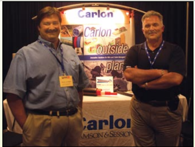
Carlon is a leading manufacturer of nonmetallic outside plant wire and cable management system products for the telecommunications, utility and electrical markets.