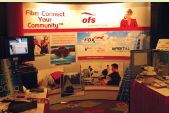
OFS fiber and fiber distribution systems are widely used in network deployments and inside plant.