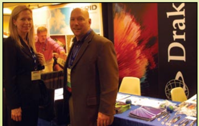
Draka Communications provides fiber and fiber cable for builds worldwide.