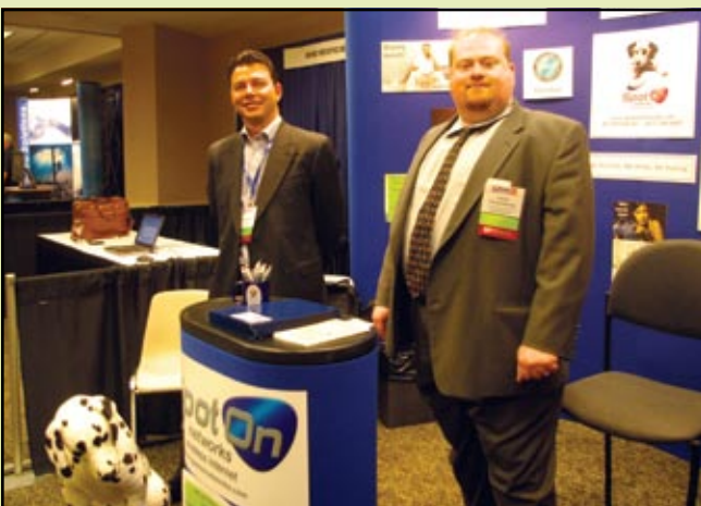
Spot On Networks provides extremely cost-effective, secure high-speed wireless Internet services to MDU residents throughout their apartments and community common areas.