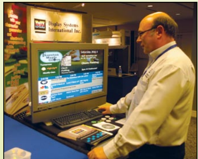
DSI (Display Systems International) offers an inexpensive but professional way to display advertising, real estate, community bulletin boards and tenant information on a local cable channel.