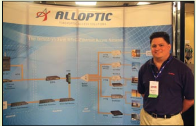
Alloptic develops optical access solutions that enable CATV, telecom and private network operators to offer converged communications, entertainment, security and automation services for both businesses and residential customers.