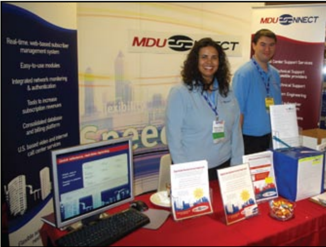
MDU Connect, Inc. offers Web-based software solutions providing a single point of customer management, billing and network operations for broadband, video and telecommunications companies.