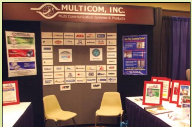
Multicom was one of the first distributors to carry FTTH products.