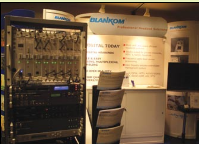
Blankom supplies professional CATV headends for digital and analog video distribution.