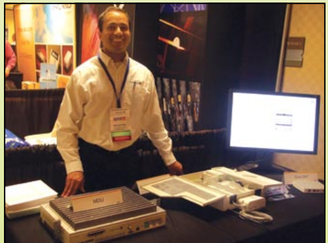
Alcatel-Lucent powers FTTH networks around the world.