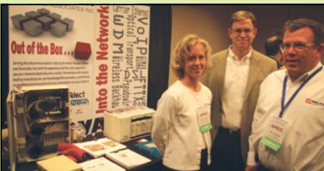
Walker and Associates has been serving the network-deployment business for more than 40 years.