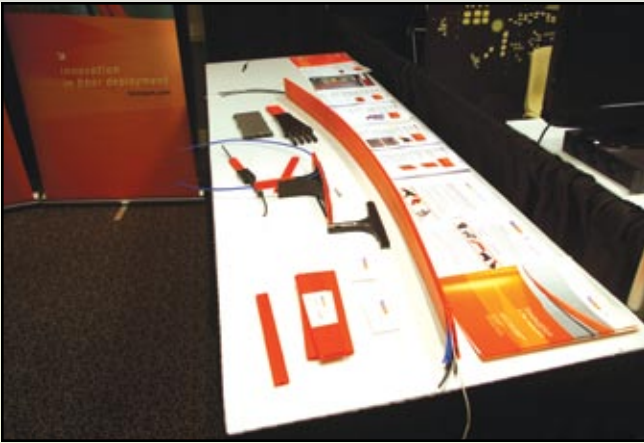
TeraSpan's innovative Vertical Inlaid Fiber (VIF) system changes the way fiber is deployed, reducing costs, maximizing versatility and minimizing environmental impact.