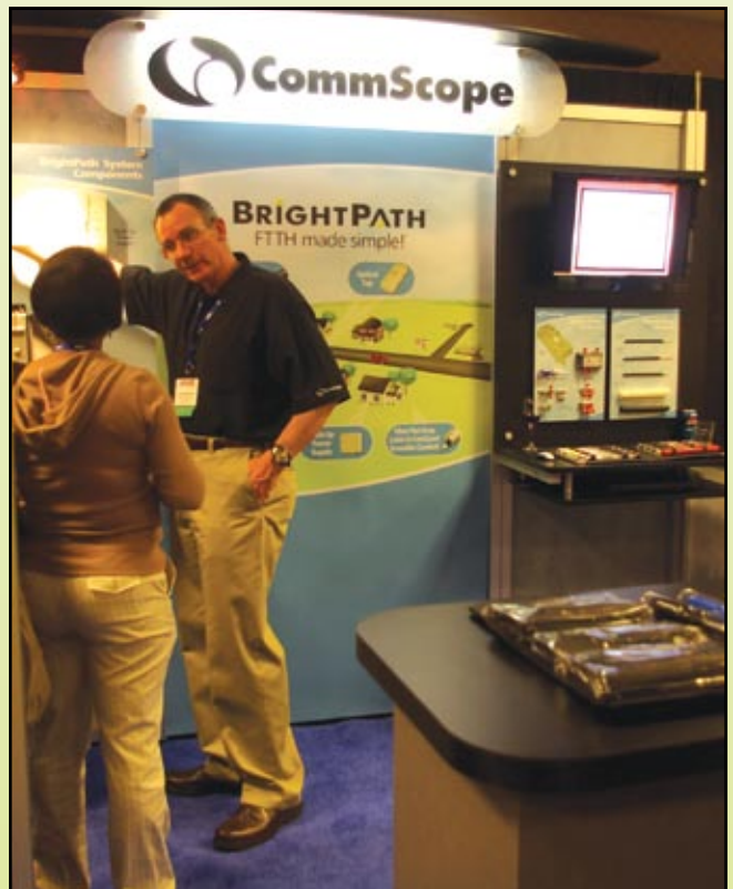
Leverage existing broadband infrastructure with BrightPath, CommScope's innovative FTTH distribution system designed to work seamlessly with existing HFC networks.