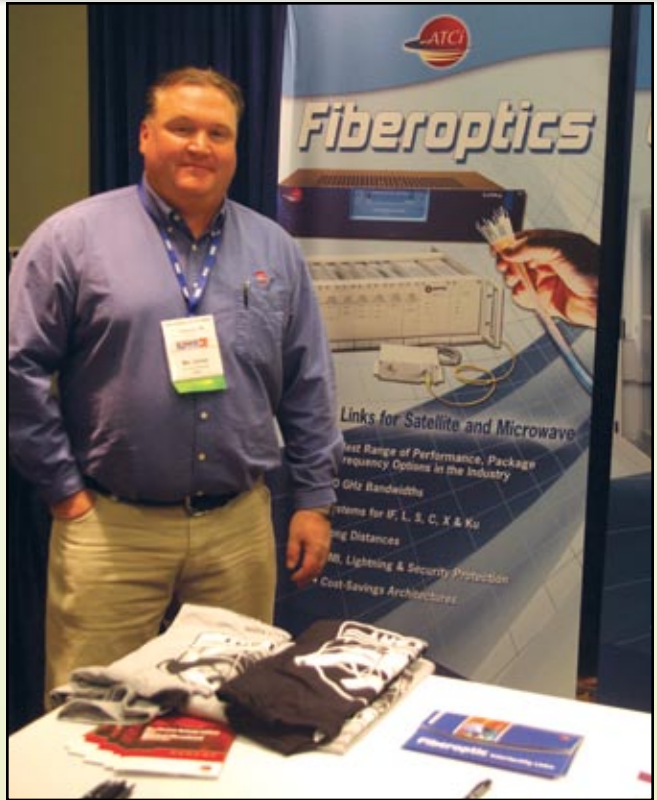
ATCi offers complete systems integration and technical services, from consulting and planning to integrating, installing and managing technology solutions.