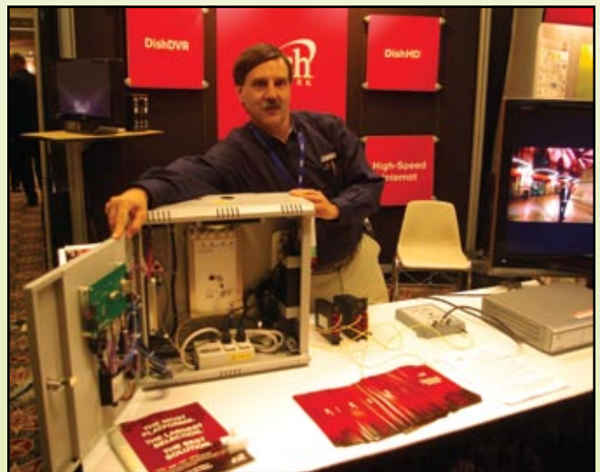
DISH Network introduced an innovative MDU signal distribution system for video.