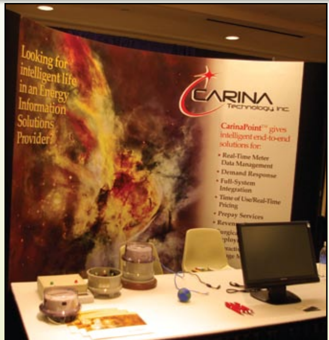
Carina's clever add-on gives electric meters an IQ high enough to monitor and suggest changes in household electricity use.