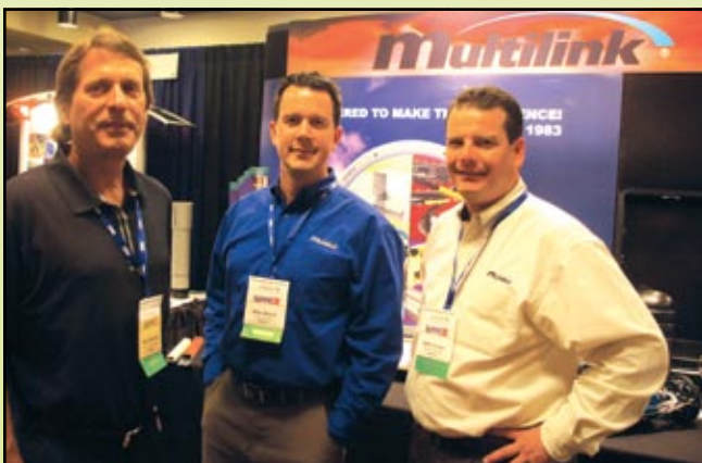
Multilink designs and manufactures a wide range of communications products supporting the FTTH, CATV, OSP and LAN/premises markets. Manufacturing and design is centered in Elyria, Ohio.