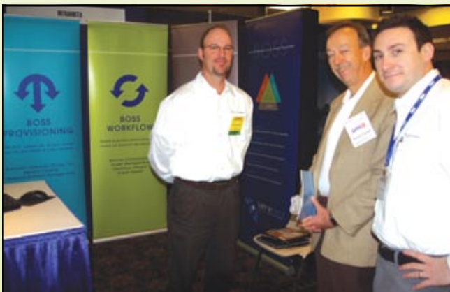
IntraMeta provides a complete back office solution for service providers. As a hosted service or on-site server, BOSS is IntraMeta's Broadband Operations Support System.