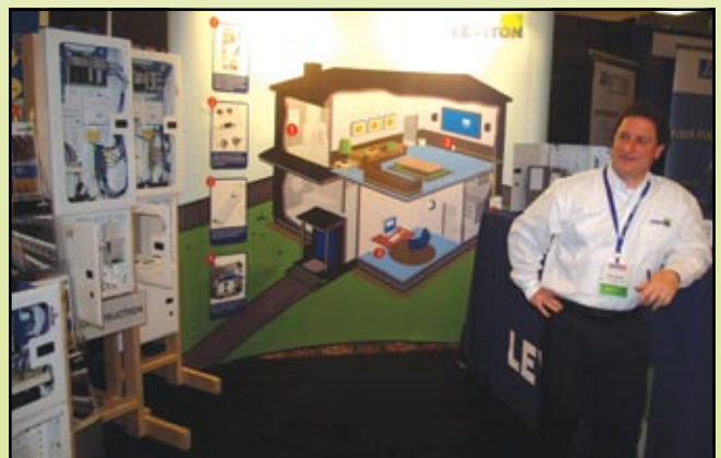
Leviton is one of the world's largest and most diversified electrical manufacturing companies, offering more than 25,000 products for nearly every connectivity need.