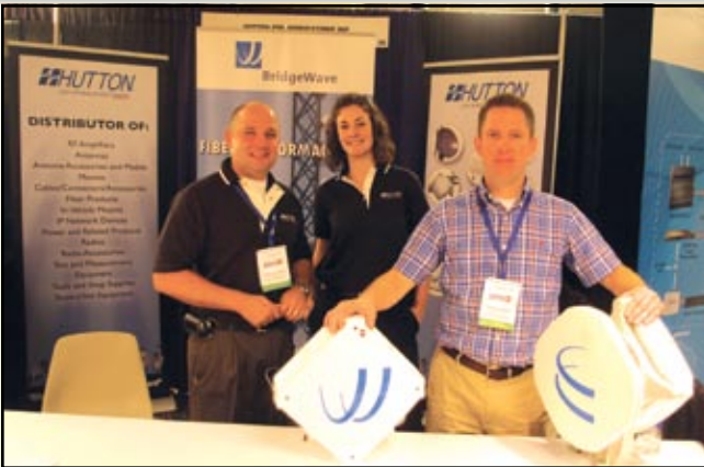
Hutton Communications Inc. is a leading distributor of wireless communications products including site infrastructure, broadband and related components, two-way radio accessories and power systems.