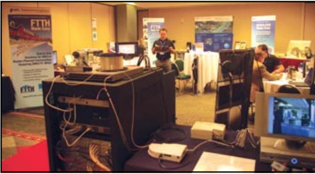
AFL provides fiber, hardware and network design and maintenance services.