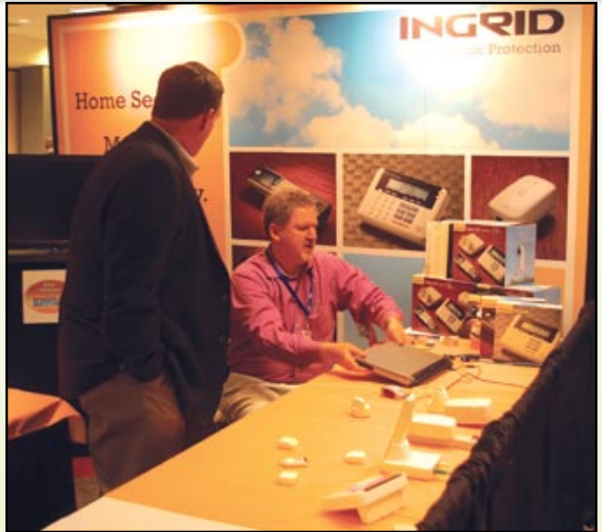
InGrid specializes in home security, enabled by broadband.