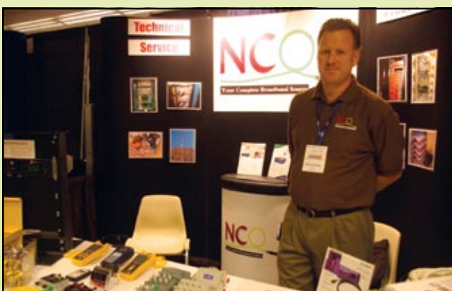
NCO-Corp, a certified minority-owned VAR based in Texas, can provide a wide range of equipment including CATV headend electronics, fiber optic products and customer premises equipment.