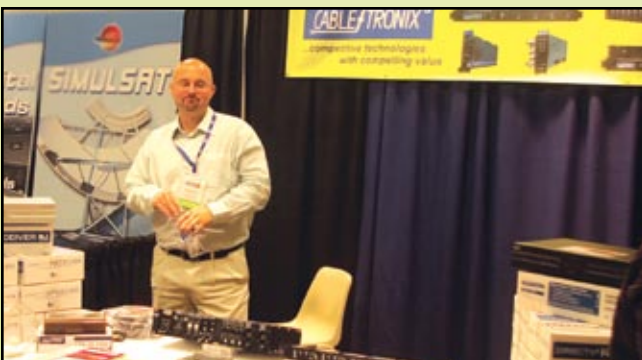
North American Cable Equipment, Inc (NACE) sells Cabletronix headend and distribution equipment, as well as prebuilt headends for full turnkey installation.

NOT PICTURED: R.L. Drake LLC is a manufacturer of commercial headend and distribution equipment for the CATV and Private CATV markets. The aptly named H2O Networks handles fiber network builds in the UK; its ability to lay fiber in sewers, and its personnel training program, are particularly noteworthy.