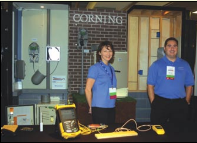
Corning, a fiber pioneer, revolutionized bend-insensitive fiber technology last year.