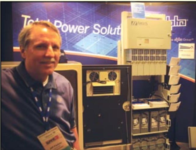
Alpha Technologies is a world-leading provider of power conversion products for FTTH applications.