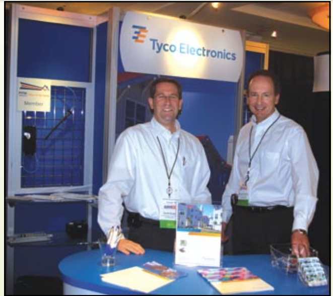
Tyco Electronics Corporation designs and manufactures fiber connectivity products for inside and outside plant.