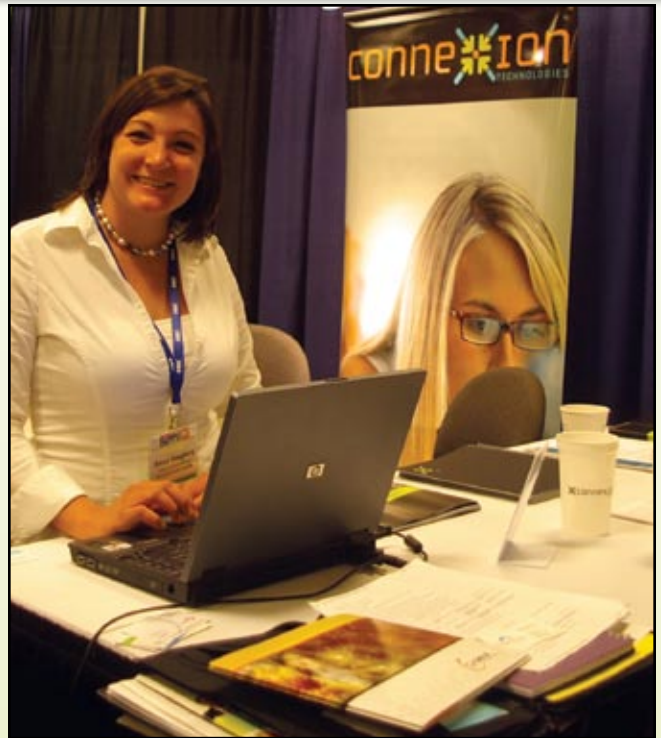
Connexion Technologies is the largest provider of network services in new communities.