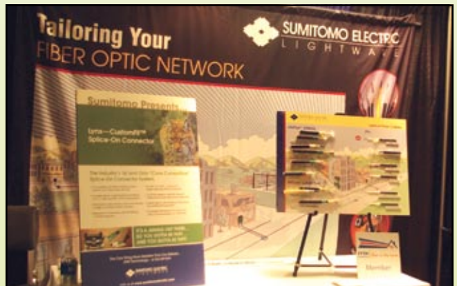
Sumitomo Electric Lightwave offers fiber optic cable, fusion splicing equipment, air-blown fiber systems and FTTH/FTTP solutions.