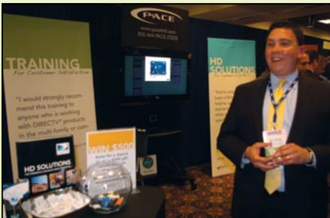
Pace manufactures and distributes a wide range of networking products for copper and fiber.