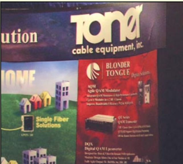
Toner Cable provides custom-built headends, digital transmission equipment, satellite downlinks, L-band and fiber optic products, as well as typical coaxial cable TV systems.