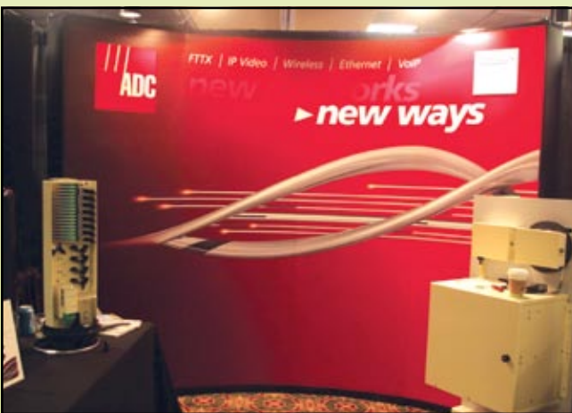
ADC's innovative network infrastructure equipment and professional services enable high-speed Internet, data, video and voice services to residential, business and mobile subscribers.