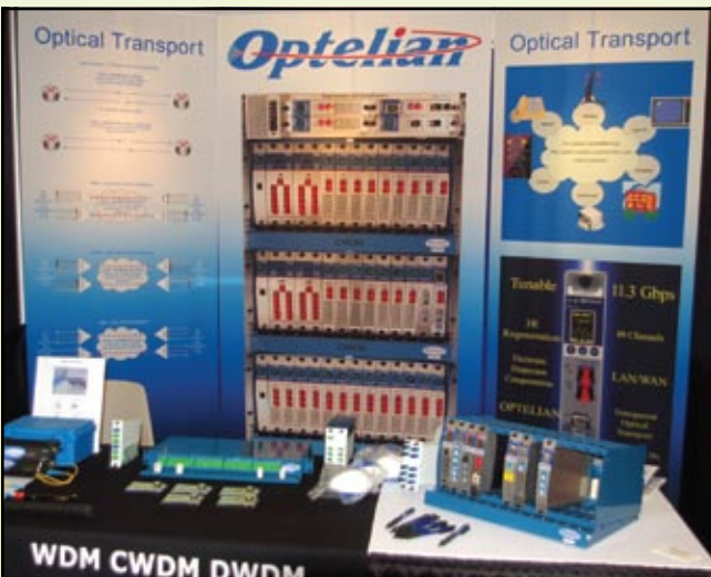
Optelian provides optical transport solutions for telco, CATV, utility, enterprise, government and educational networks. It has a wide product portfolio using WDM, CWDM and DWDM.