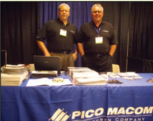
Pico Macom , founded in 1962, offers complete end-to-end solutions, including headend and electronics equipment, fiber optic equipment, distribution products, subscriber products, test and measurement equipment, and drop installation materials.