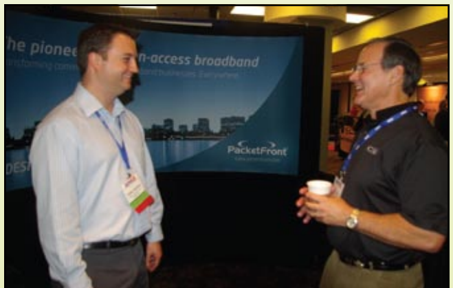
PacketFront, a Swedish-based pioneer in open-access networks, now has customers around the world; it recently took over management of network operations for UTOPIA in Utah.