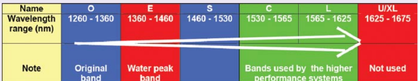
Table 1. ITU-T definition of telecom optical wavelength bands. (The arrow stands for the wavelength increase and the general trend toward higher performance systems.)

Both EPON and GPON are time-division multiplexing systems.