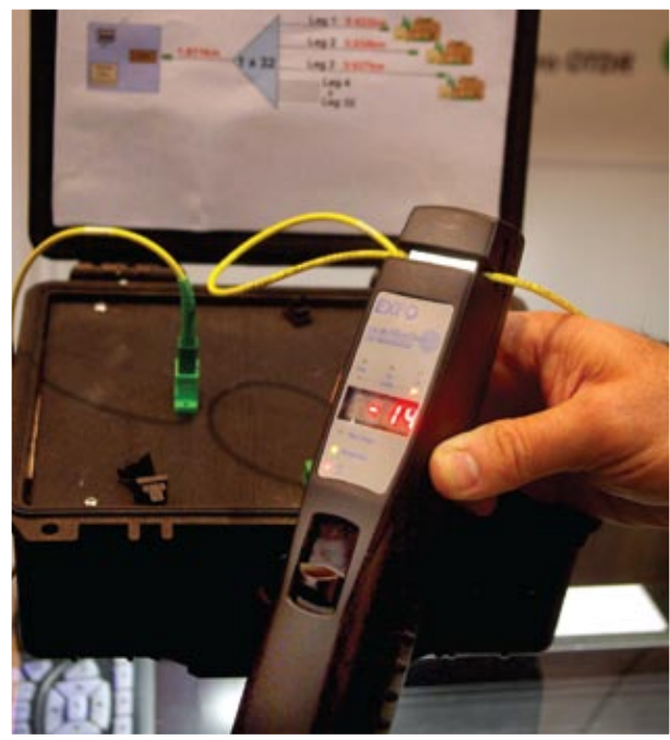
EXFO fiber identifier (live fiber detector). Fiber is bent when clamped into the device, which then “reads” the light traveling inside.

or joining with a mechanical connector. They cost as little as $80, but the most rugged units are $150-200. There are “video” versions selling for $500 to $1,300 (with small screens; versions that plug into a laptop cost less) that can be used to inspect fiber in hard-to-reach spots such as the back of a patch panel.