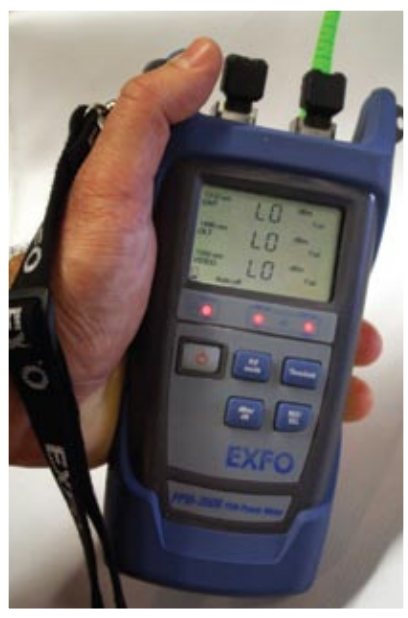
PON power meters such as this one from EXFO are inexpensive and easy to use.

at which it enters the fiber's end. The more off-center the angle, the more the light bounces off the inner surface of the fiber, and the longer the path. Single-mode fiber has a sharply restricted entry angle, hence the signal retains its sharpness better (that is, it has lower modal dispersion). Multimode fiber is more expensive than single-mode, but is less expensive to deploy. The smaller diameter of single-mode fiber makes it more difficult to splice, and to test. It is also more