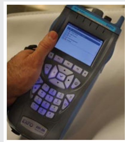
EXFO’s modular AXS-200 Sharp-TESTER can be used for both copper and fiber testing tasks.

Mode: A path that light follows in a fiber. Multimode fiber is thicker than single-mode, so the light beam that carries the signal may follow multiple paths, depending on the angle