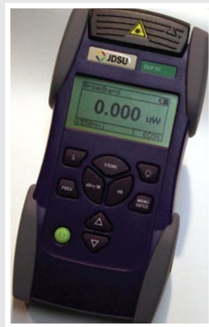
Handheld optical power meter.

Fiber inspection microscope: Just what it sounds like – a microscope designed to easily inspect fiber to make sure it is clean, before splicing