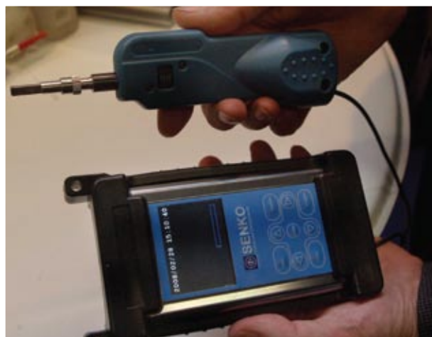
Senko FiberView camera for inspecting the ends of fiber, attached to a 2.5-inch portable monitor. Up to 23,000 images can be stored on an SD card in the device.

turing defect, the molecular structure is changed in a way that can polarize light. Different polarizations travel at different speeds in the fiber, causing the signal to spread slightly (see dispersion). This can limit bandwidth in very high bandwidth (10 Gbps or greater) or in very long network links. Testing for it requires transmitting a signal and reading it with interferometry or some other technique such as Jones-Matrix analysis.