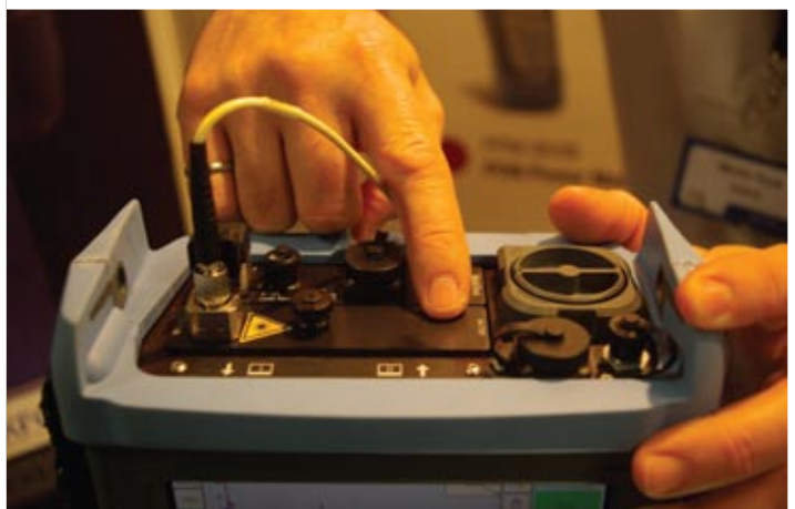
Modular OTDR from EXFO is handheld but heavy (about 6 pounds). This device has two module bays, for handling a wide variety of tasks.